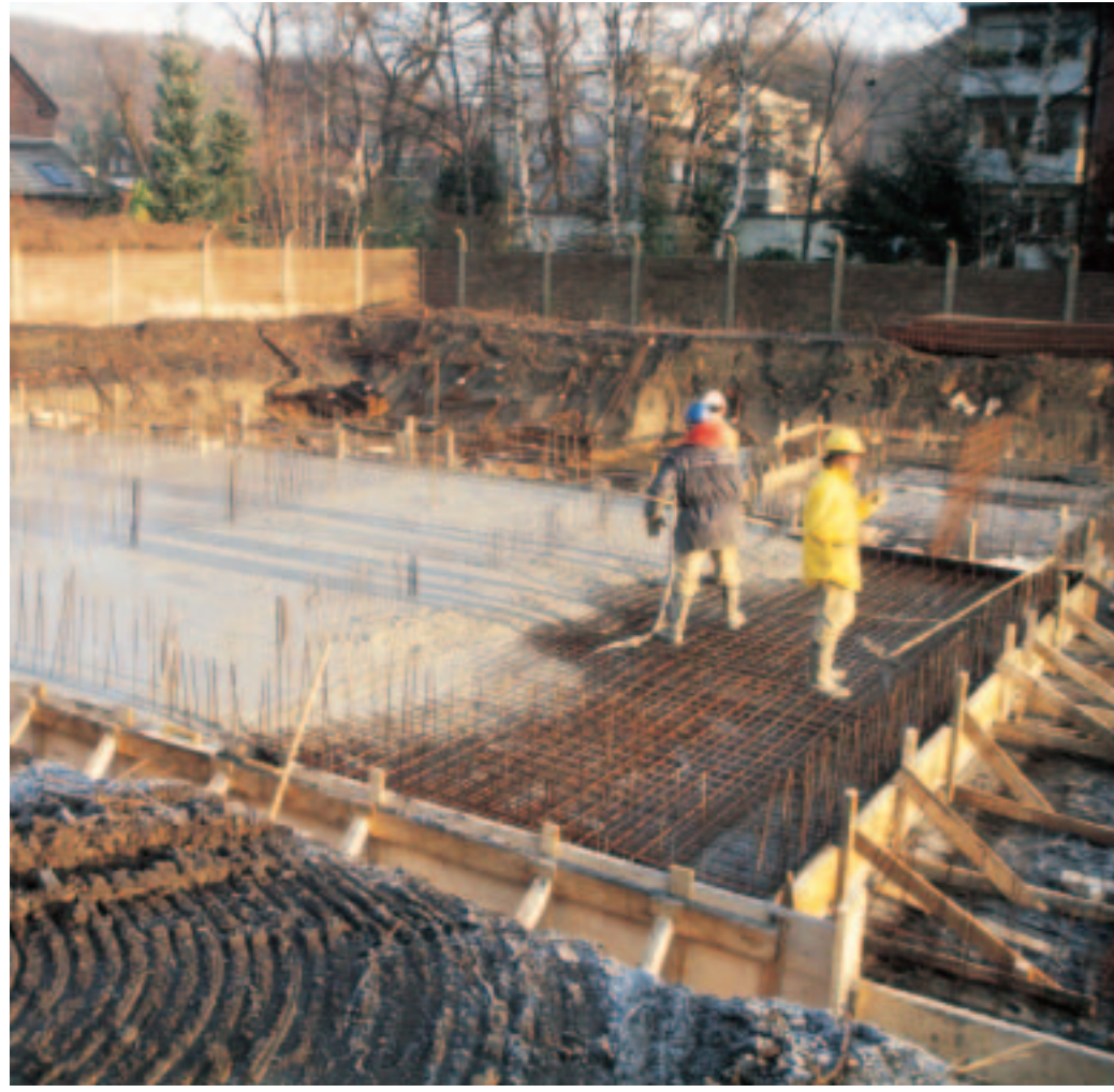
DELTA®-MS Sub-base Course will bear the weight of workers and wheelbarrows, saving time and money.