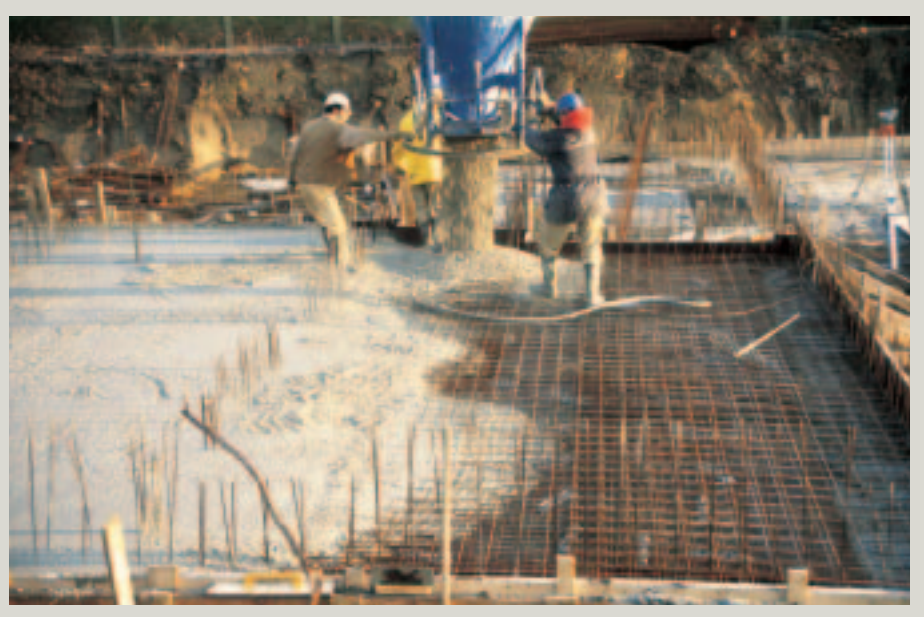
A demonstration of the high compressive strength of DELTA®-MS Sub-base Course.