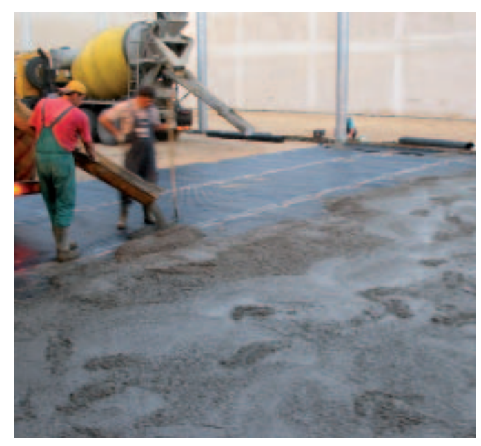
DELTA®-MS Sub-base Course offers a high degree of safety when applied under fibre concrete.