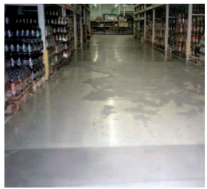
Ideal protection from damp for resin floors. A waterproof system is created by firmly bonding connections and overlaps using either DELTA®-THAN cartridge adhesive or DELTA®-THENE-BAND T 300. Before DELTA®-MS is laid out, the floor slab must be covered with about 1cm of sand to keep the sheets from shifting.