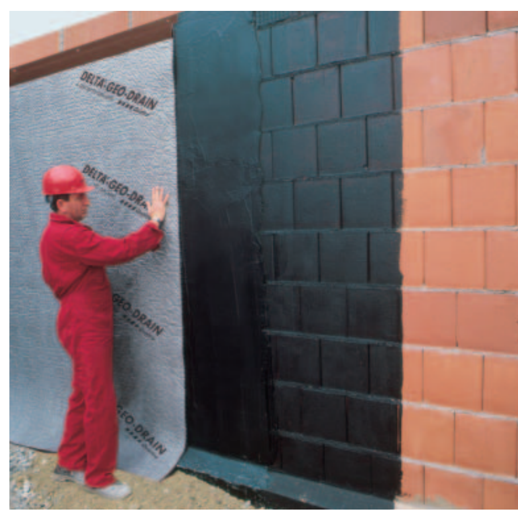
DELTA®-GEO-DRAIN Quattro – a compact unit that can be swiftly installed in one go.