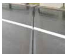
Single gap joints