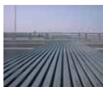
Modular expansion joints