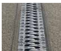
Cantilever finger joint