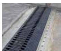
Sliding finger joints