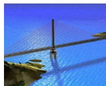
Agin Bridge (TR)