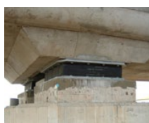
LASTO®LRB & HDRB