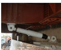
RESTON®SA & STU