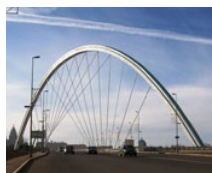
Ramstore Bridge (KZ)