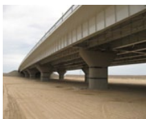
Awaza Bridge (TM)