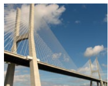
Vasco da Gama Bridge (PT)